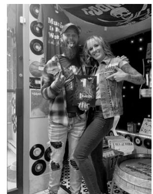
KRAKEN Visits Hard Luck!